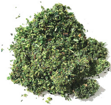
w/o Trim Saver

Maximize Profit Without Wasting Your Trim