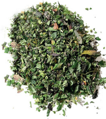
w/ Trim Saver